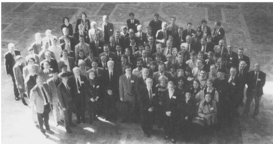
Reception at City Hall